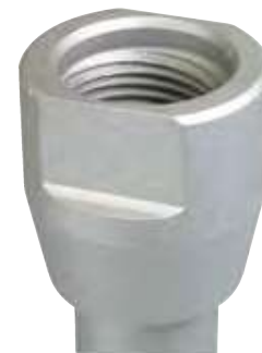
Threaded arbor M18 x 6P1.5